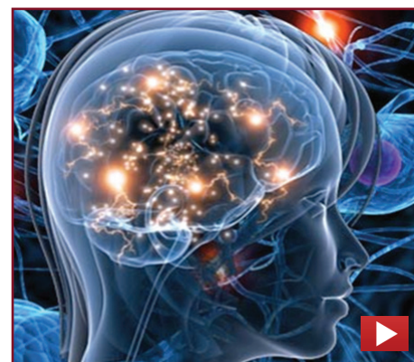
Mind, Thinking & Creativity