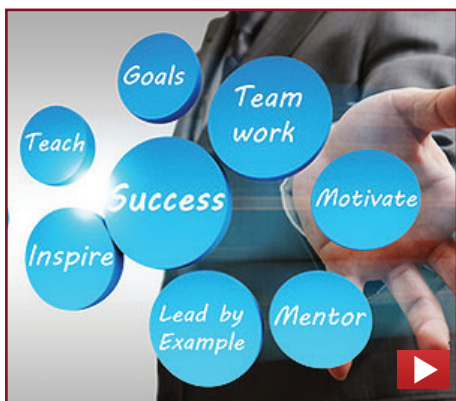
Essence of Effective Leadership

The video recordings of the previous WAAS-WUC courses are available on the WUC website. Interested participants can apply for a certificate of participation by contacting the WAAS administrative team.