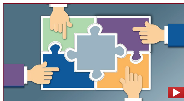
Toward an Integrated Science of Society