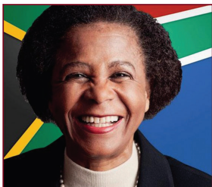
MAMPHELA ALETTA RAMPHELE (SOUTH AFRICA)

Former Anti-apartheid activist; Former Managing Director of the World Bank; Trustee of the Nelson Mandela Foundations; Founder of the Open Society Foundation for South Africa and the Citizens Movement.