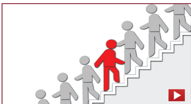
Individuality and Values in Social Evolution

The video recordings of the previous WAAS-WUC courses are available on the WUC website. Interested participants can apply for a certificate of participation by contacting the WAAS administrative team.